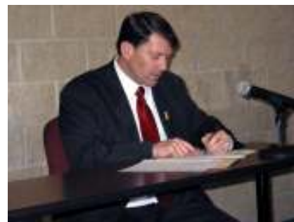
Governor M. Michael Rounds

"This is the largest community in the state, yet public higher education has not had a home until now for the six universities to share resources," Rounds said. "You've also given young people and people that are young at heart more hope," he concluded.